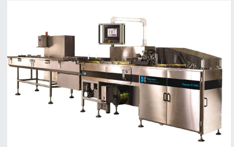
Infeeds offered for a fully integrated packaging solution