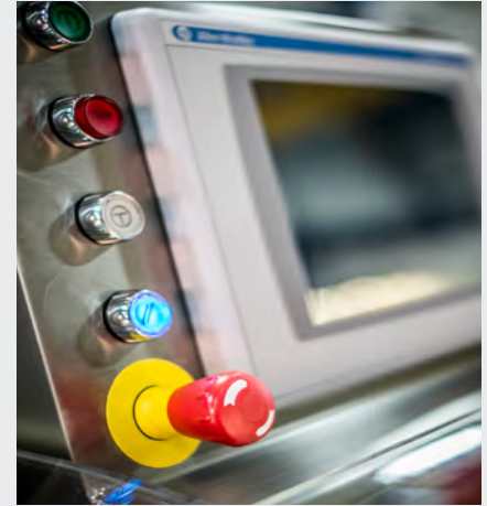
Icon-Based Operator Interface with Intuitive Set Up Features