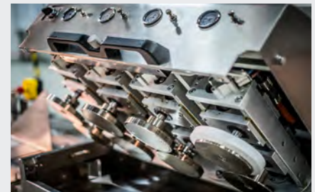
Quick changeovers and easy-to-clean features