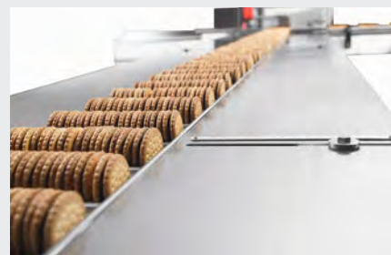
Biscuits on Edge