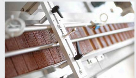
Automatic Feeder (option)