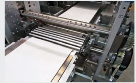
Rotary Crimper for End Seals