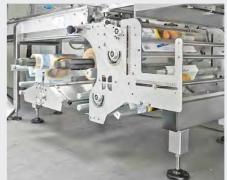
Bottom Film Feed