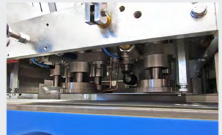
Overhead Long Seal Unit