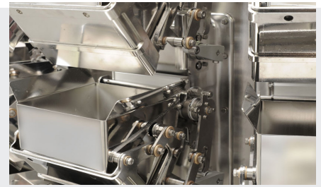
Stainless steel buckets with push-pull action guarantees speed and silence

It is a color touch screen display in which it is possible to upload data from any remote net device, including palmtop and tablet units. The RCW can monitor up to 12 IP Cams connected to the machine through a standard Ethernet bus. HMI can be loaded into the most common Internet browsers. RCW memorizes all information related to weights included weights in discharged buckets registering them on log files.