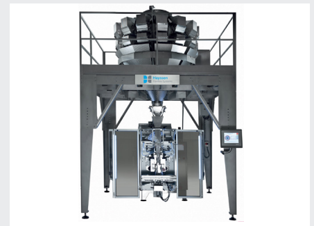
Custom solutions for integrated scales and baggers

Hayssen Flexible Systems S.r.l Via Trieste, 53 | Mestrino (PD) | 35035 ITALY t. +39 049 9006511