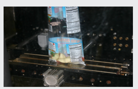
Continuous Motion Reciprocating Jaws for the Strongest Seals

Hayssen Flexible Systems S.r.l Via Trieste, 53 | Mestrino (PD) | 35035 ITALY t, +39 049 9006511